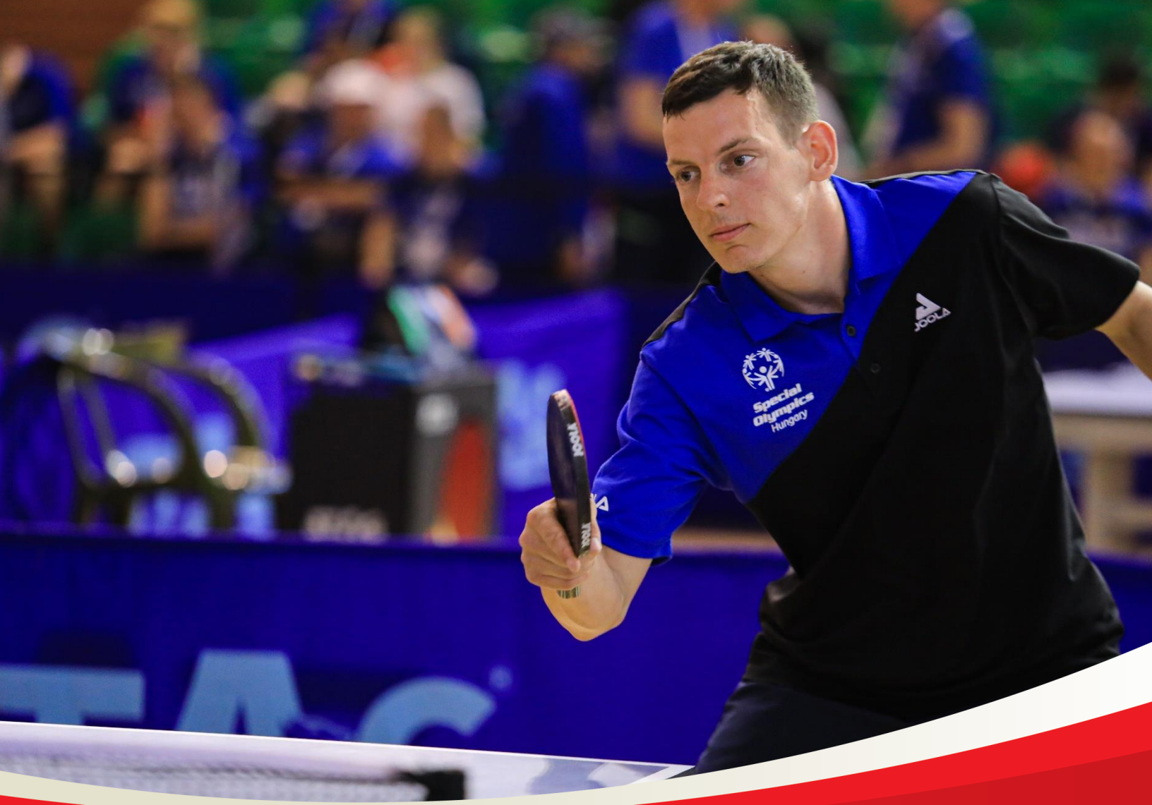
Table Tennis Sport Rules