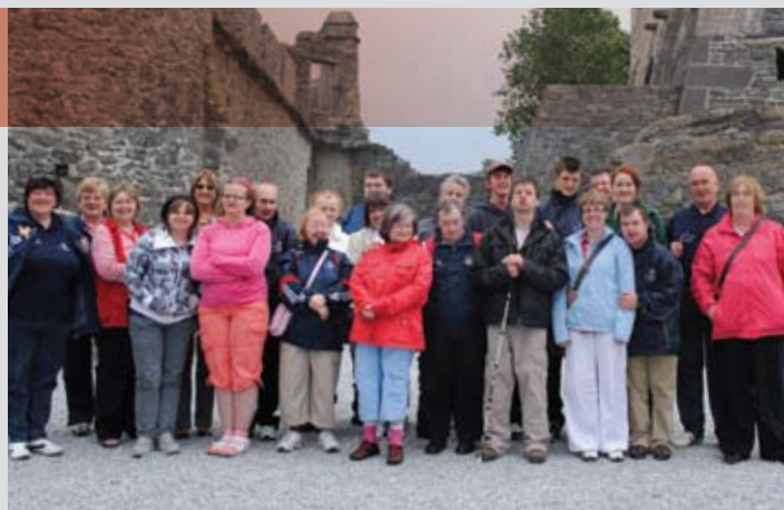
Above: Bruff All Stars athletes, families & volunteers pictured at their first club summer outing to Killarney