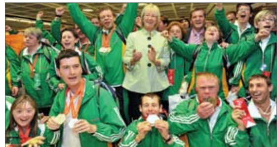
Minister for Tourism, Culture & Sport, Mary Hanafin T.D. with members of Team Ireland.